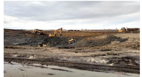
Paving the Expanded Parking Lot at Quality Trailer on October 25

Nearing Completion of the West Detention Basin on Nov. 2