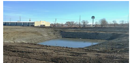
Completed West Drainage Basin