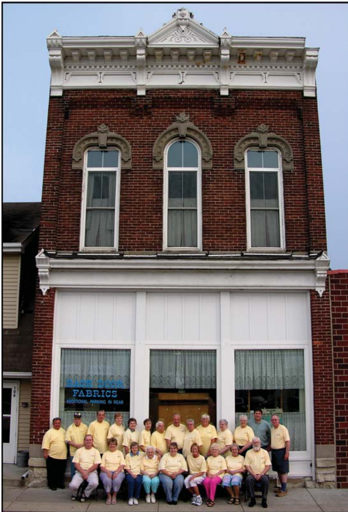
Altoona Historical Society Members in front of the New Historical Center